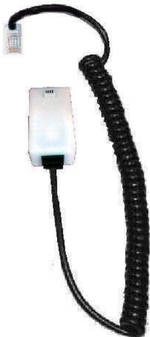
SRM PROBE HEAD with CABLE

The probe is also available with the “flush mount” housing in which the tips are recessed deeper into the outer housing so that the tip retraction is limited, resulting in a lower spring pressure than the stated gram load (see the bottom of the next page for an image showing the difference between the standard housing and the flush mount housing).