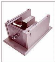
Magnetic flux density input system 0.55T, 1.0T