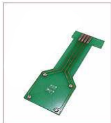
PCB Sample Holder (6mm×6mm, 20mm×20mm)