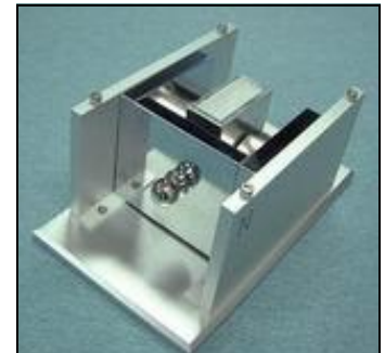
Sample kit with 0.55 Tesla magnet supplied standard with the system.